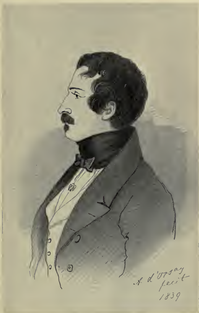
LOUIS NAPOLEON BONAPARTE. Afterwards the Emperor Napoleon III.